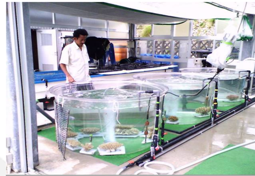
Coral Rehabilitation Lab Akajima Island.